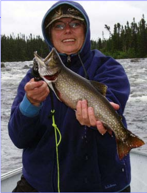
A healthy, hungry wild brook trout from northern Quebec.