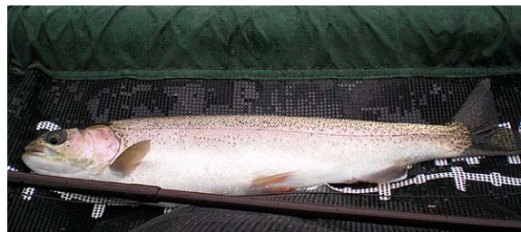
A beautiful Nest Lake rainbow in the apron of my float tube.

Here in Maine, I use my float tube on some of our favorite trout ponds. I can't think of anything more fun than paddling about at dusk, listening for rises from hungry Brookies. One of things I love about my float tube is that I can fish in any direction in a matter of seconds. If I hear a rise behind me, I can turn and cast to it instantly. Another great thing about fishing from a float tube is how small my "footprint" is. I've seen trout rise 18" away from me, not realizing that I was there. What a thrill! It's also a wonderful low-impact exercise, and is easier on my knees and back than sitting in a canoe for many hours.