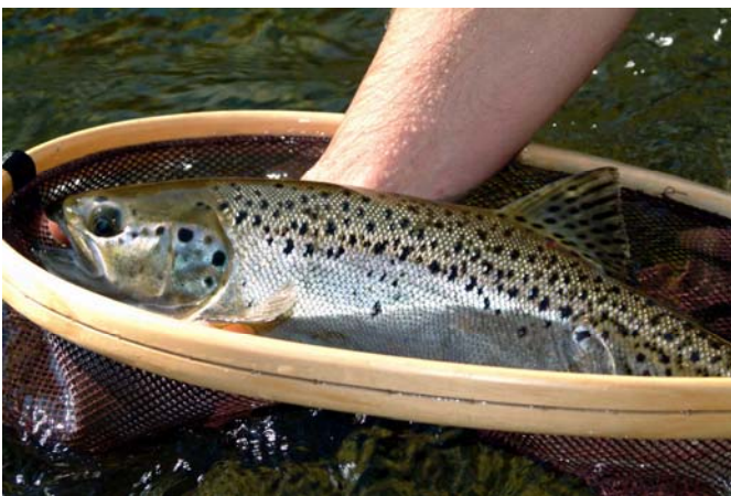
You'll learn how to safely catch and release trout in the Casting to the Future fly fishing program sponsored by the Merrymeeting Bay Chapter of Trout Unlimited